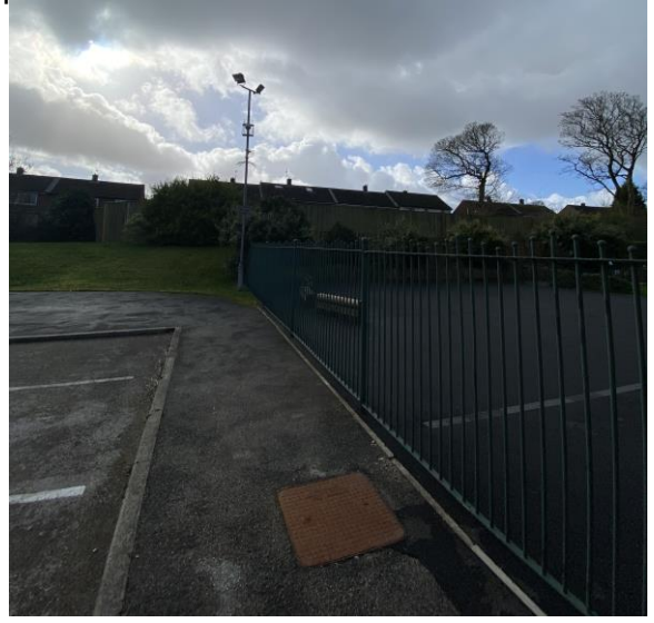
Figure 1: Case Officer Site Photos